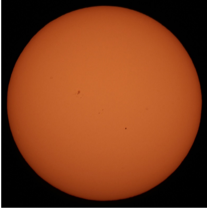
Photo of the May 9, 2016 transit of Mercury. Mercury is the small dot on the center right. Note how tiny it is, even compared to the small sunspot on the center left.