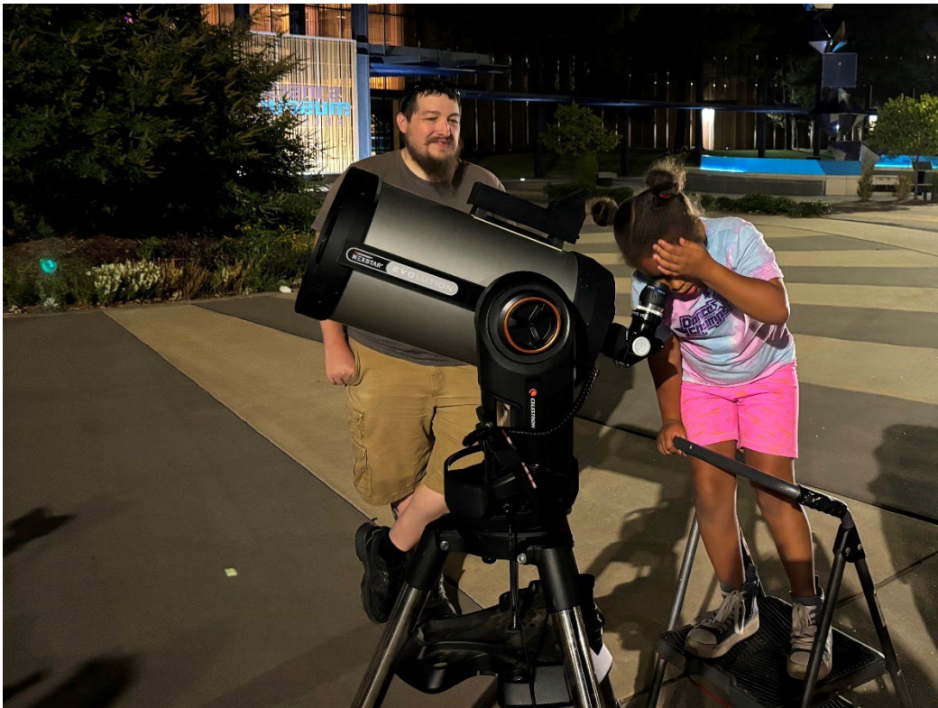
International Observe the Moon Night, September 2024.

NASA's Night Sky Network is one of the most successful and longstanding grassroots initiatives for public engagement in astronomy education. Started in 2004 with the PlanetQuest program out of the Jet Propulsion Laboratory and currently supported by NASA's Science Activation, the Night Sky Network (NSN) is critical in fostering science literacy through astronomy. By connecting NASA science and missions to support amateur astronomy clubs, NSN leverages the expertise and enthusiasm of club members, who bring this knowledge to schools, museums, observatories, and other organizations, bridging the gap between NASA science and the public. Now in its 20th year, NSN supports over 400 astronomy clubs dedicated to bringing the wonder of the night sky to their communities across the U.S. and connecting with 7.4 million people across the United States and its territories since its inception.