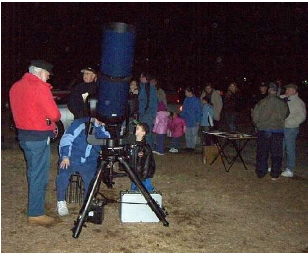
Raynham Public Observing Night, February 2004.